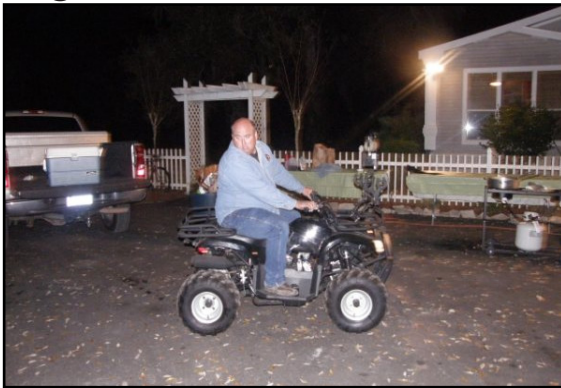
Needless to say, he stayed over for the night

Corvair Houston 1907 Iron Ridge Sugar Land, TX 77478-4116