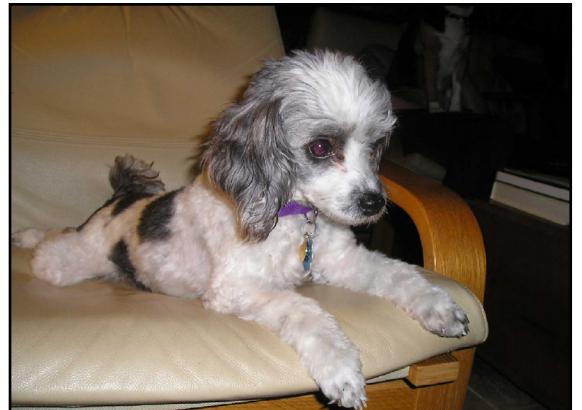
Bridget: the one who didn't bite me.

Learned Not to Interfere When Two Miniature Poodles Get Into A Fight Over A Dingo Minibone." We have three poodles that were originally toy poodles, but over the years they have moved up a weight class, so they are now miniatures. They like food. In fact, if they had free access to food, they would probably look like fuzzy beachballs with little stubby legs. Gracie, who is nearly blind and has lost some teeth, always finishes her rawhide minibone in minutes, and then she stalks 15-year-old Sandy, who has teeth, but spends two or three hours gnawing on hers. As soon as Continued on Page 4